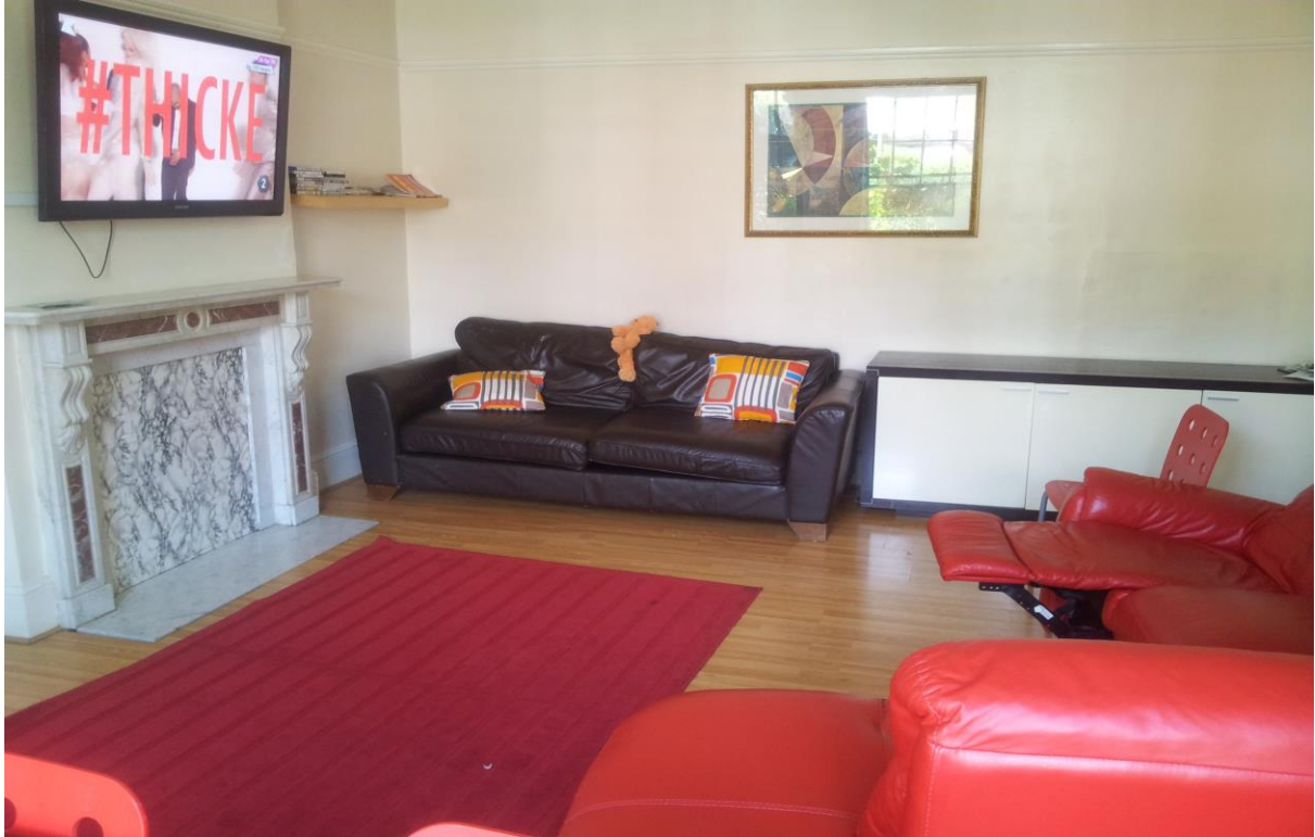
Side view of lounge and dining